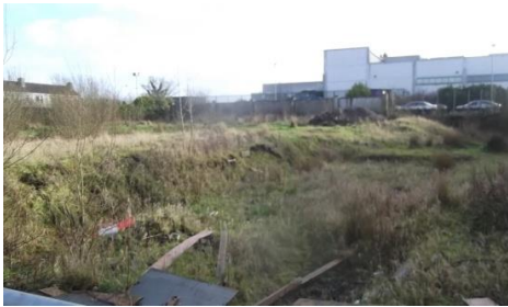
Pic A: Community Garden Before....