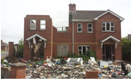
Pic A: Palace Crescent Before: