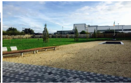
Pic B. Community Garden After